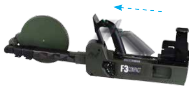
Step 2 Lock handle and shaft into place