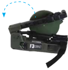
Step 1 Release arm strap and pivot shaft