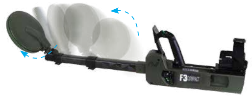
Step 3 Rotate search head and extend shafts